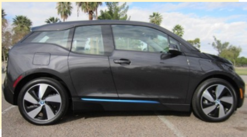
2014 BMW i3 REX VIN: WBY1Z4C50EV274557