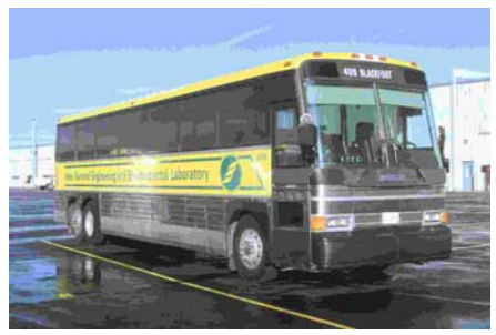
Idaho National Engineering and Environmental Laboratory Bechtel BWXT Idaho, LLC