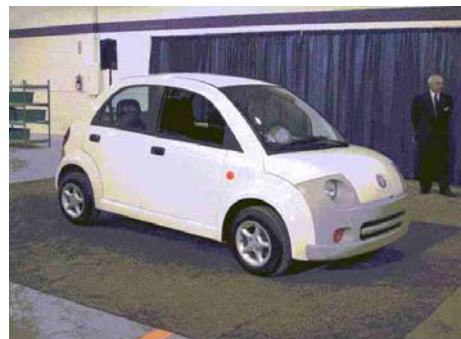
Figure 3. Dynasty Motorcar IT NEV.