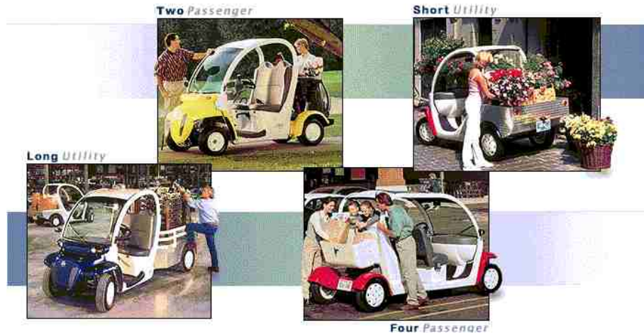
Figure 5. GEM NEVs in different applications.