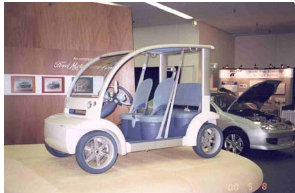
Figure 1. Ford/Th!nk Neighborhood NEV.