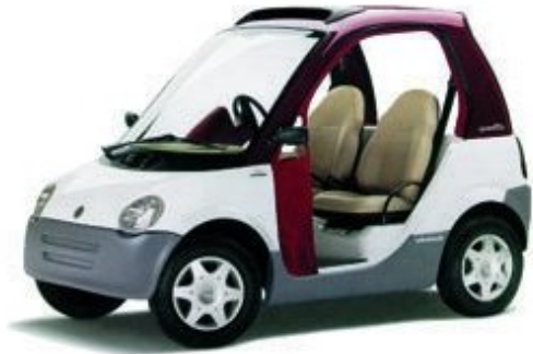
Figure 4. Bombardier NEV.

The NEVs are being used in a variety of applications (Figure 5), with 56% used on private roads, 32% used on public roads and 12% used on both public and private. Below is a list of the missions and locations for the NEVs. The fleets identified the following: