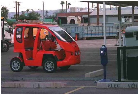
Figure 2. Frazier Nash NEV.

A NEV is 4-wheeled, generally larger than a golf cart but smaller than a light-duty passenger vehicle. NEVs are usually configured to carry two or four passengers (Figures 1, 2 and 3), or two passengers with a pickup type of bed, or two passengers with various maintenance support equipment.