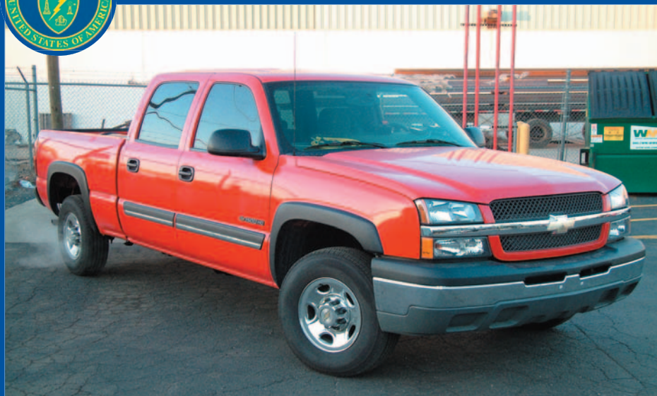
2005 Hydrogen ICE 1 Truck